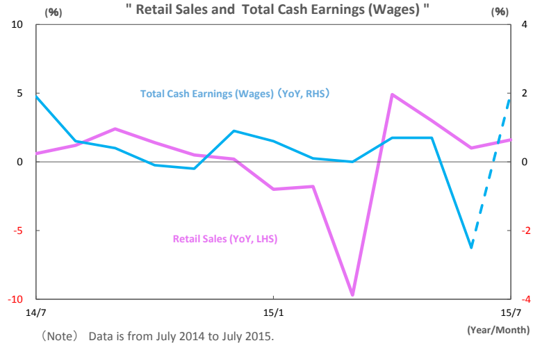
Bloomberg L.P. estimate used for July 2015 Total cash earnings (wages).